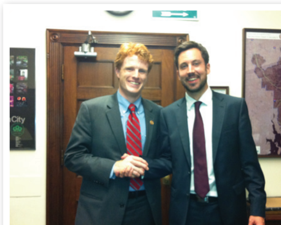
With Congressman Joe Kennedy in his offices in Washington DC