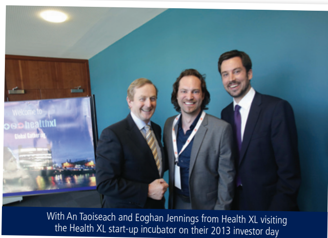
With An Taoiseach and Eoghan Jennings from Health XL visiting the Health XL start-up incubator on their 2013 investor day

In 2011 I proposed the introduction of a new Enterprise and Investment Visa scheme along the lines of a scheme adopted in the UK. The Government subsequently announced the introduction of two major new initiatives: The Immigrant Investor Programme and The Start-up Entrepreneur Programme. Both aim at facilitating (non-EEA) migrant entrepreneurs and investors who want to invest either their time or money here in Ireland for the purpose of saving or creating jobs. The schemes have netted €10.5 million in additional investment since April 2012, creating over 120 jobs. The scheme was rebooted following a review this July to make it even more competitive and I continue to pursue the introduction of a visa specifically for the Tech sector.