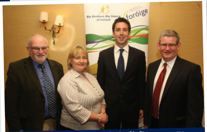
With Members of the Foróige Big Brother Big Sister programme

The Government is investing €100 million in school building projects. As a result St Mary's National School on Belmont Avenue, Donnybrook has received a grant to undergo an extension and refurbishment works. It is expected that these works will progress quickly to tender and begin construction before the end of this year. Work is also currently at design stage for a new school building for Griffith Barracks Multi-Denominational school, and a new primary school is to be built in the Sandymount-Ringsend area.